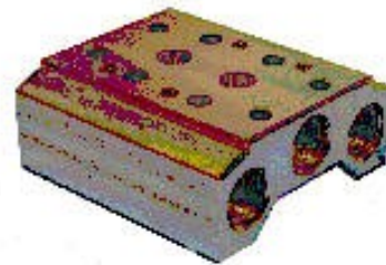
TWO STATION MANIFOLD